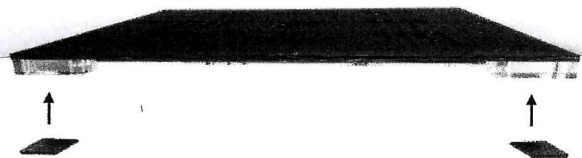
Fig. 2. Installation of anti-slide stickers.

To prevent sliding of the "S" legs - use the rubber stickers (provided with the lamp) and install them on the underside of the legs (Fig. 2).